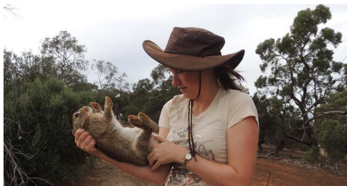
RABBIT-FREE AUSTRALIA SUPPORTS RESEARCH FIELD WORK