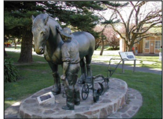
Angaston Agricultural Bureau Centenary Sculpture 'Day Off, Peter'

Agricultural Bureau of South Australia Inc. PATHWAY TO IMPROVEMENT